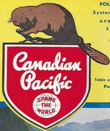
Table of Co Page 6