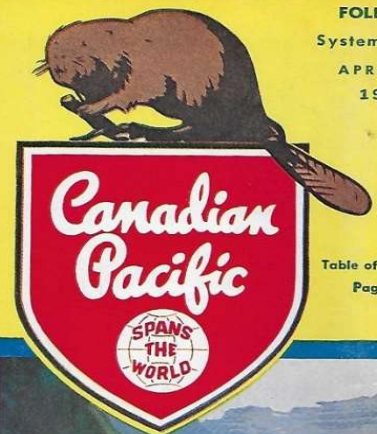
Table of Contents Page 6