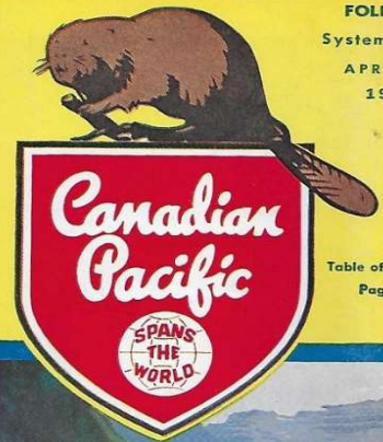
Table of Co Page 6